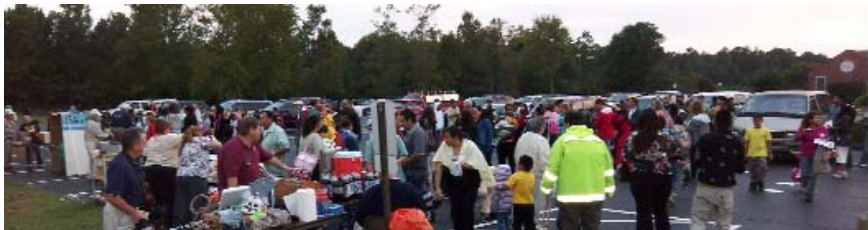
There was a great turnout