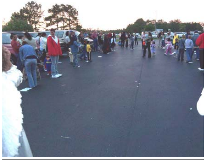
What game is this?