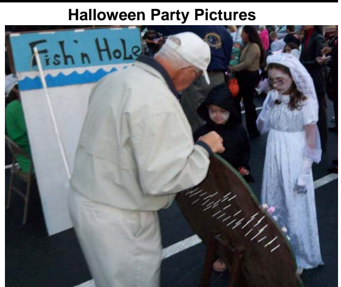
Halloween Party Pictures