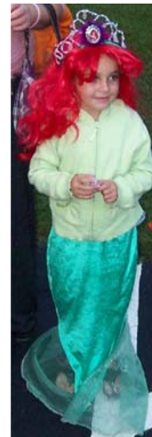
Now that's a redhead!